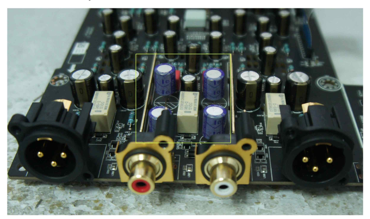
Wima film capacitors